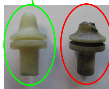
Correct pinball comparing with a worn one