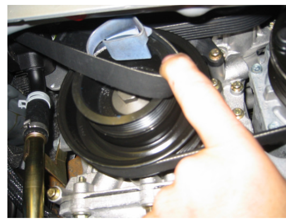
Fig. 7

Now use the ratchet to turn the crankshaft further from 12 o'clock to the 9 o'clock position. The belt is pulled onto the crankshaft pulley, and the positioning aid is then removed. The belt is still not lying in an aligned position on the crankshaft pulley. Again, it is necessary to turn the engine two to three times. After a test run, the covers can be remounted.