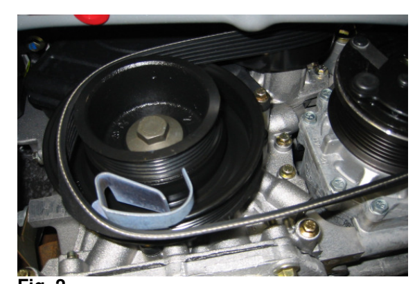
Fig. 2