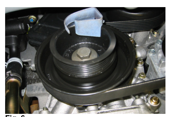
Fig. 6