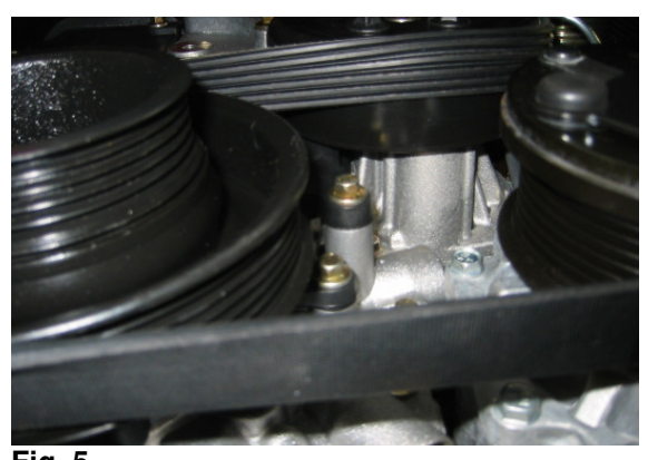
Fig. 5