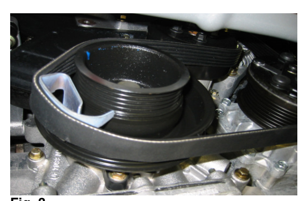
Fig. 3