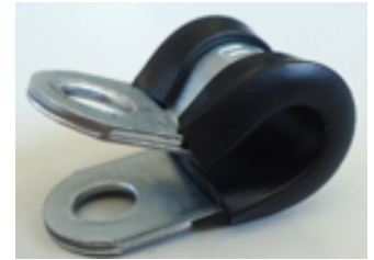
Example of non-welded brackets

Sometimes the brackets should be reused , so it is important to pay attention to the disassembled pipe to ensure that all fixings provided by the old pipe or supplied with the new AJUSA pipe are properly installed.