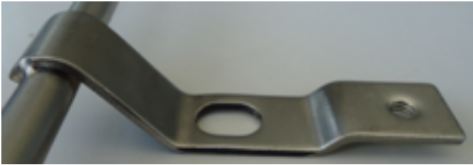
Example of welded fixed fasteners

Most oil pipes have non-welded brackets and fixed fasteners welded to the tube.