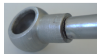
Example of fatigue rupture in the banjo-pipe junction area